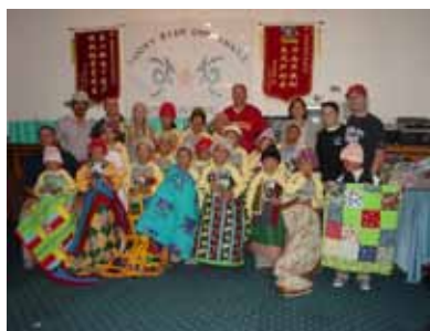
Children receive quilts and hats from the team.

We then spent the early afternoon sorting the many items we brought for our friends. As you can see by the picture, the new backpacks that were filled with educational supplies for the new school year were well received along with a new school uniform for each student. Thanks to all of our great friends who helped fund this project.