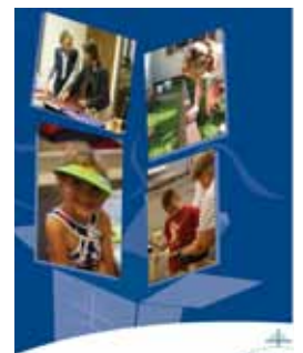
2010 Fall Opportunities

Pick up our Fall Opportunities booklet today in the back of the Sanctuary and the Family Life Center or at the Information Centers.